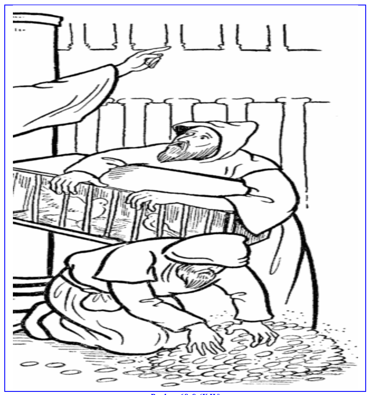
Psalms 69:9 (KJV) For the zeal of thine house hath eaten me up; and the reproaches of them that reproached thee are fallen upon me.